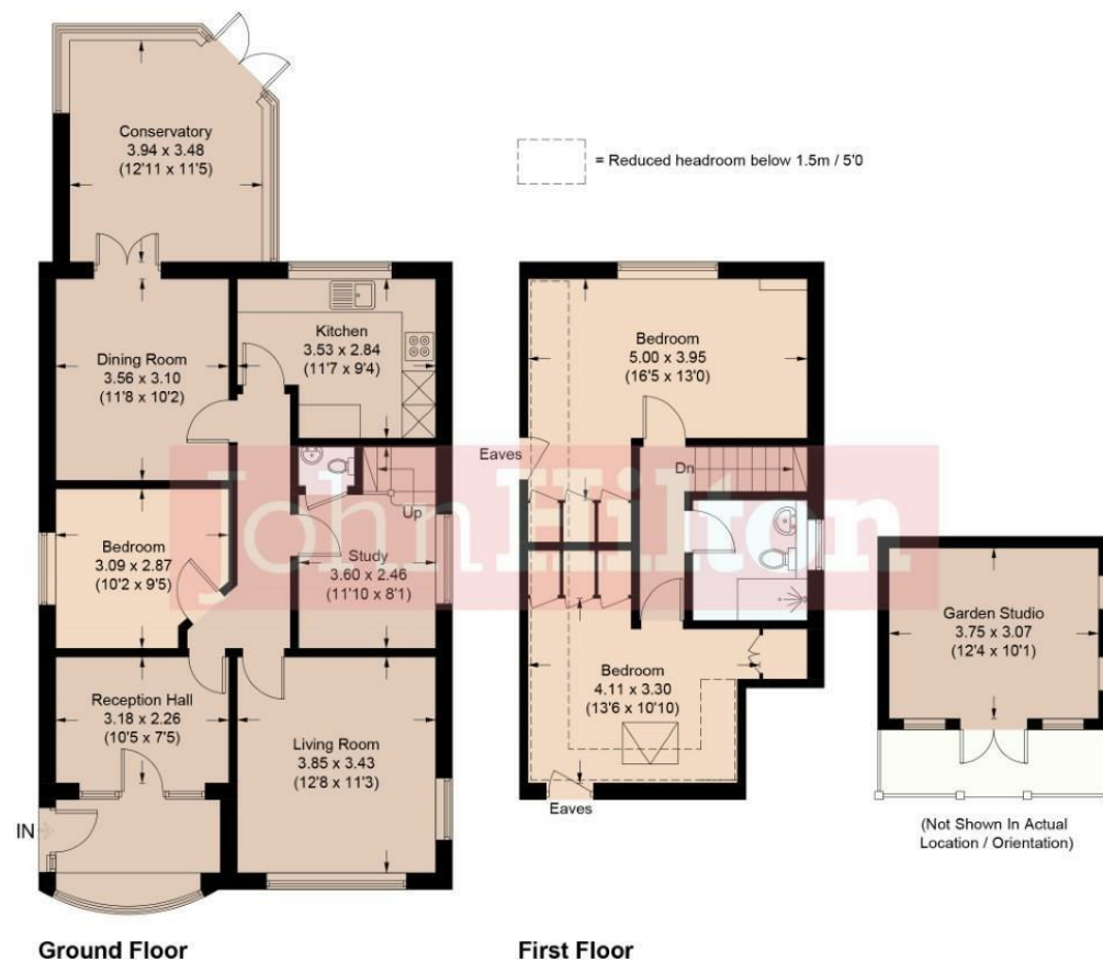
Illustration for identification purposes only, measurements are approximate, not to scale. Imageplansurveys @ 2026